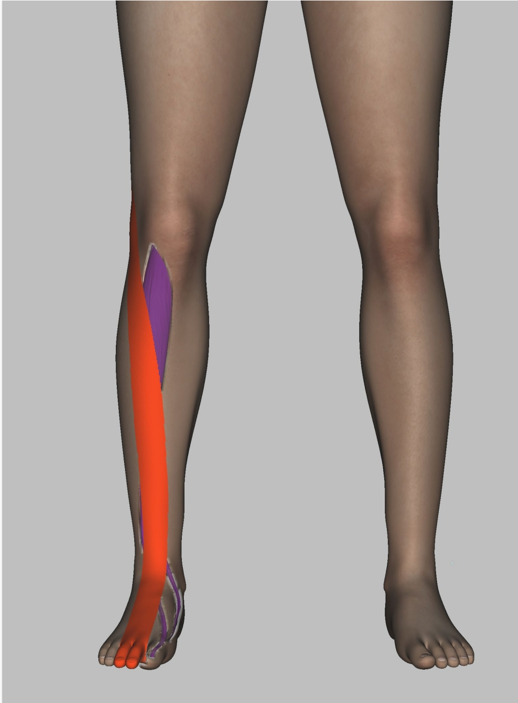
Figure 2. Superimposing symptoms of a spinal disc herniation on an anatomical avatar.

Sorting out the relevant disorders to be represented is one of the most crucial aspects of the design process, since fundamental decisions about the architecture of the system occur at this stage. As the visual modalities of color and texture only allow for the representation of two independent data items per location at a time, special care needs to be taken in information